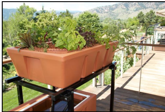
A small $1200 system sold as a kit

The last thing to consider that is needed is a 10' by 10' ft space with a water source and adequate sunlight.