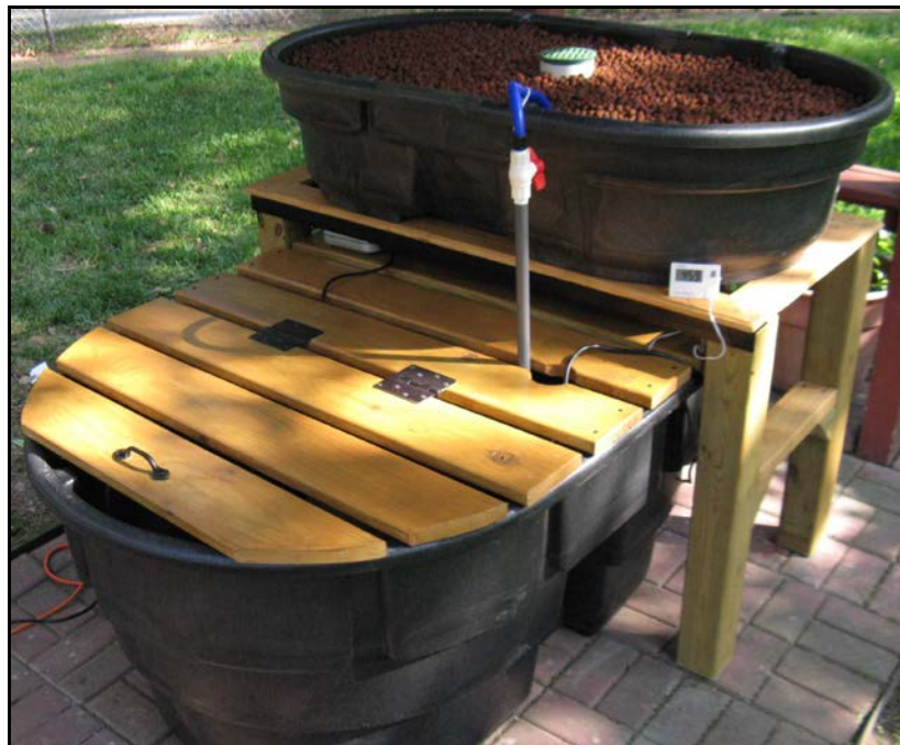
A simple backyard system designed for home food production. Learn how to build a system just like this at www.easydiyaquaponics.com .

Backyard systems offer the ability to "upgrade" and add components for increased food output. There's also more room to experiment as those who have mastered aquaponics often do.