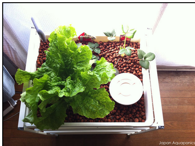
Indoor aquaponics Japanese style.

Many people have created indoor hydroponic systems using artificial lighting and timers for the flood and drain systems. These technologies and techniques can be adapted for aquaponics as well.